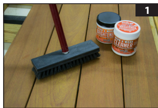
1. CLEAN, RINSE, & LET DRY

For best results, first clean surface with DeckWise® Cleaner and Brightener.