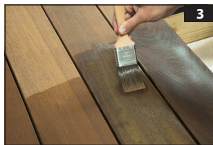
3. BACKBRUSH ANY PUDDLES

For complete Use & Care instructions go to: www.deckwise.com